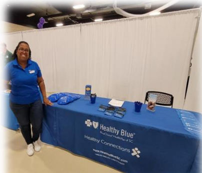
Healthy Blue/Healthy Connections present as exhibitor.