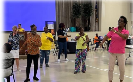
Attendees participating in line dancing.