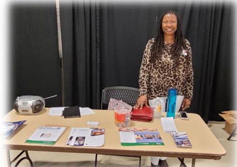
Vocational Rehabilitation present as exhibitor.