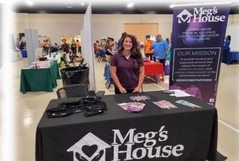
Meg's House present as exhibitor.