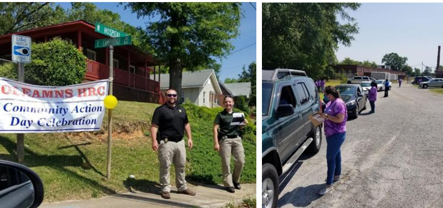
(Left Photo) Greenwood police officers directing drivers to the event. (Right Photo) Cars lined up as GLEAMNS event staff speak with drivers about Community Action Day.