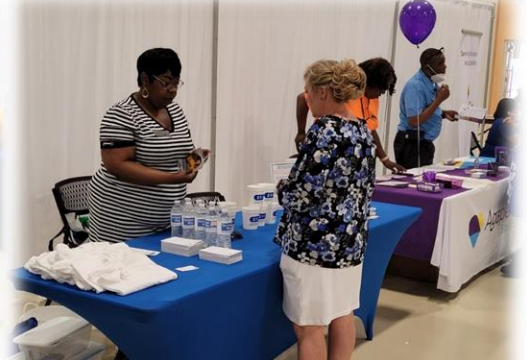
United Way of the Lakelands present as exhibitor, networking with attendee.