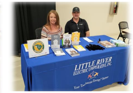
Little River Electric Cooperative present as exhibitor.