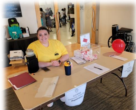
Event staff welcoming attendees.