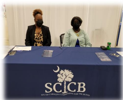
SC Commission for the Blind present as exhibitor.