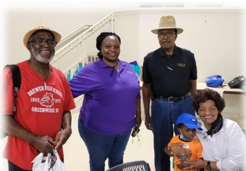
GLEAMNS Board Members present.