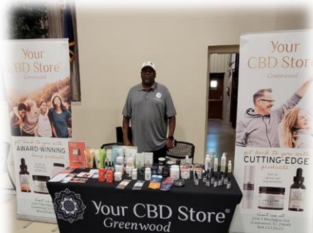
Your CBD Store present as exhibitor.