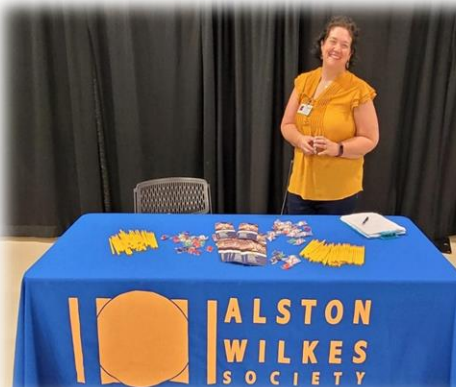
Alston Wilkes Society present as exhibitor.