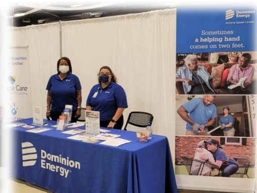
Dominion Energy present as exhibitor.