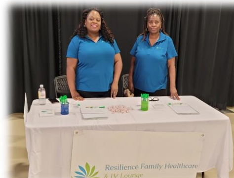
Resilience Family Healthcare & IV Lounge present as exhibitor.