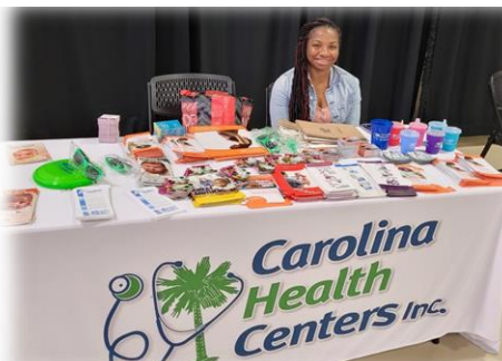
Carolina Health Centers present as exhibitor.