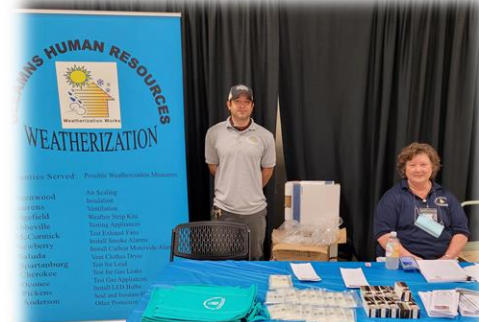
GLEAMNS Weatherization present as exhibitor.