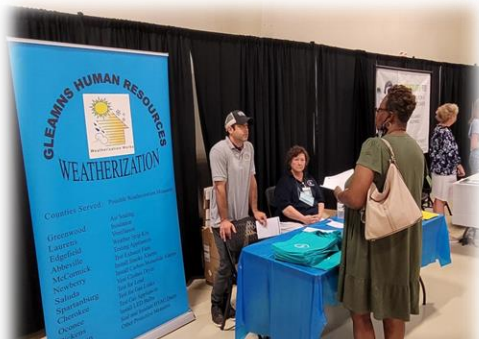
Exhibitor speaking with attendee.