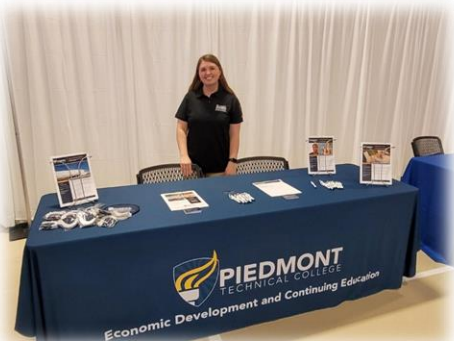
Piedmont Technical College present as exhibitor.