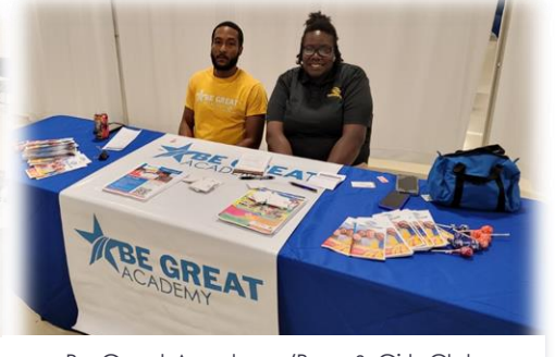
Be Great Academy/Boys & Girls Club present as exhibitor.