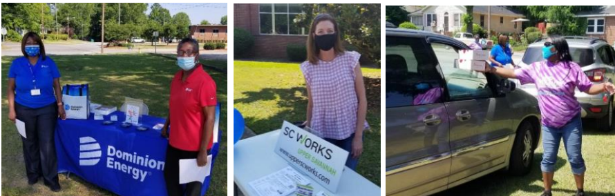
(Left Photo/Middle Photo) A few exhibitors, including Dominion Energy and SC Works/Upper Savannah, were stationed along the drive-through route. (Right Photo) GLEAMNS event staff handing food items to attendee driving through event.

GLEAMNS Community Services Dept. 301 N. Hospital Street Greenwood, SC 29646 Phone: 864-229-8862 Fax: 864-227-1729 www.gleamnshrc.org