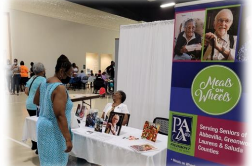
Meals on Wheels present as exhibitor, speaking with attendee.