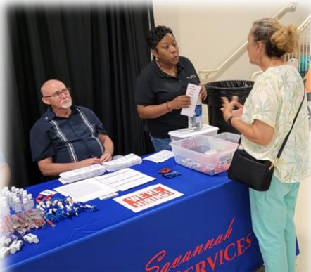
Upper Savannah Care Services present as exhibitor, speaking with attendee.