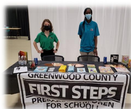
Greenwood County First Steps present as exhibitor.