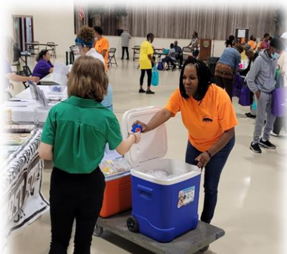
Event staff handing out refreshments.