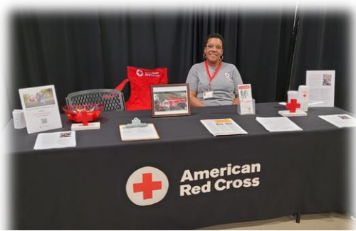
American Red Cross present as exhibitor.