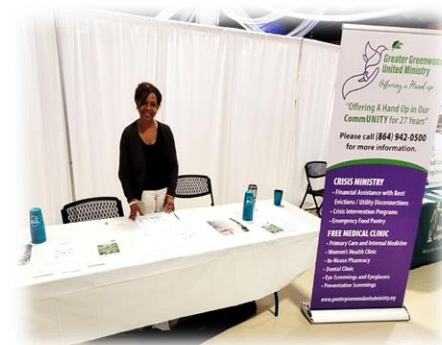
Greater Greenwood United Ministry present as exhibitor.