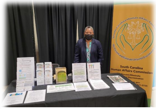
SC Human Affairs Commission present as exhibitor.