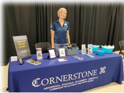
Cornerstone present as exhibitor.