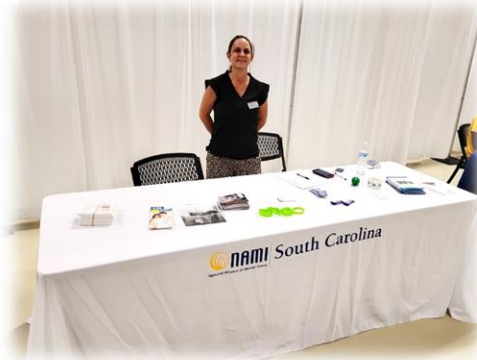
National Alliance on Mental Illness (NAMI) present as exhibitor.