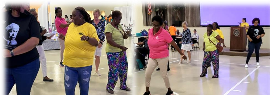
Participants getting down on the dance floor. Prizes were given out to the dancers giving the most energy.