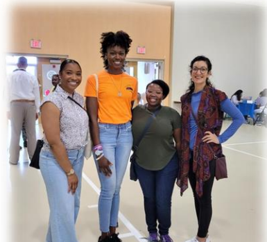
SC Office of Economic Opportunity (OEO) present. (Shown with event staff)