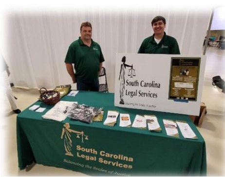
SC Legal Services present as exhibitor.