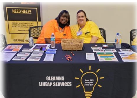
GLEAMNS Community Services present as exhibitor.