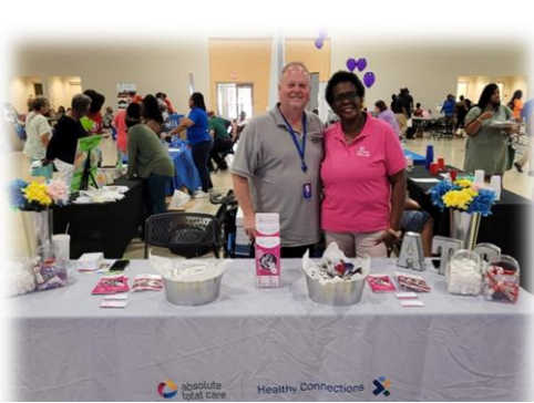
Absolute Total Care/WellCare present as exhibitor.