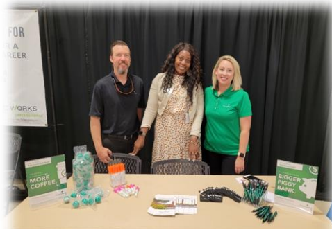
Countybank present as exhibitor.