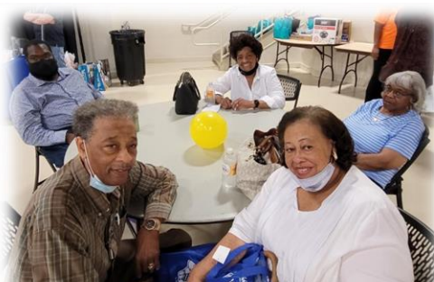
GLEAMNS Board Members and attendees waiting for event to begin.