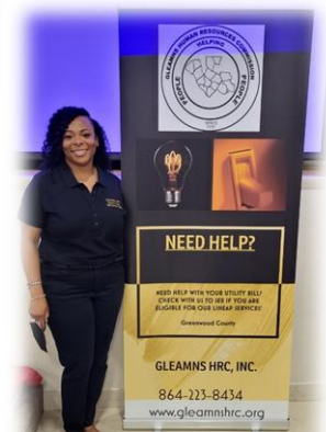
GLEAMNS CEO present for the event.