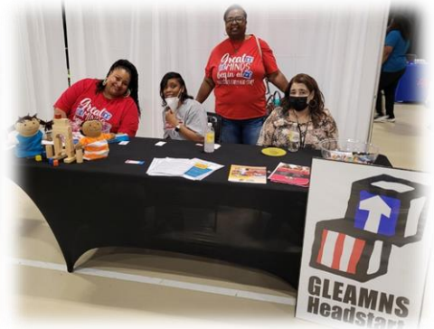
GLEAMNS Headstart present as exhibitor.