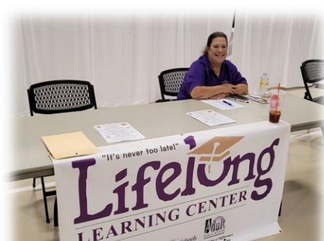
Lifelong Learning Center present as exhibitor.