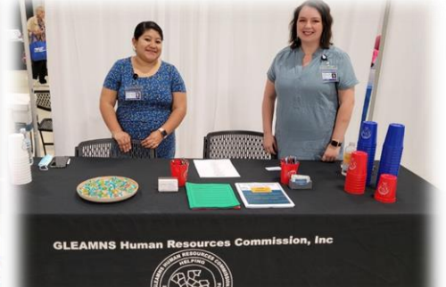
GLEAMNS Human Resources present as exhibitor.