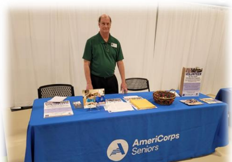
Foster Grandparents/AmeriCorps Seniors present as exhibitor.