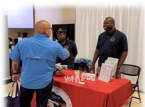
Attendee and exhibitors in discussion.