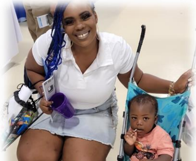
Attendees smiling for the camera.