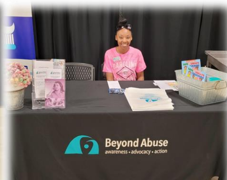
Beyond Abuse present as exhibitor.