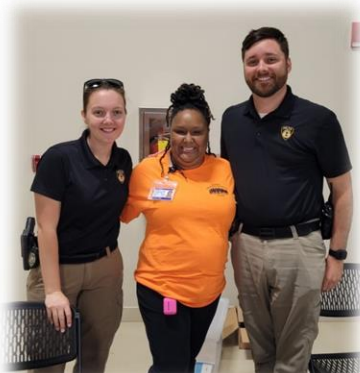
Greenwood Police Department/Community Engagement Team present as exhibitor. (Shown with event staff)