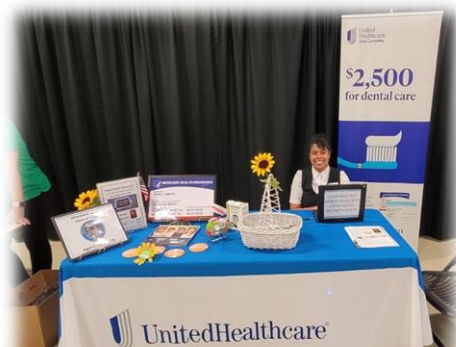
UnitedHealthcare present as exhibitor.