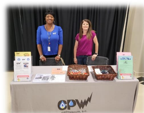
CPW Greenwood present as exhibitor.