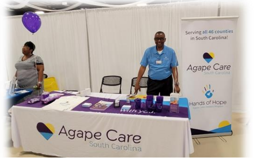
Agape Care present as exhibitor.