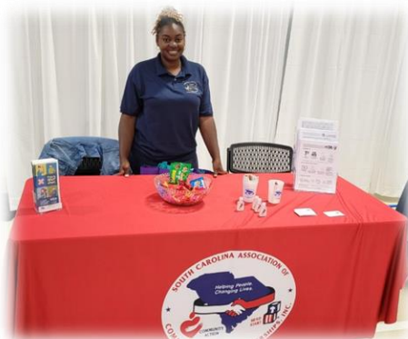
SCACAP COVID V.O.I.C.E.S. present as exhibitor.