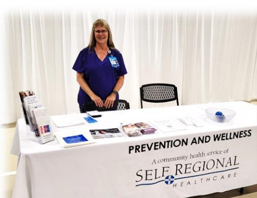
Self Regional Healthcare present as exhibitor. Self Regional Health Express provided free health screenings to attendees.