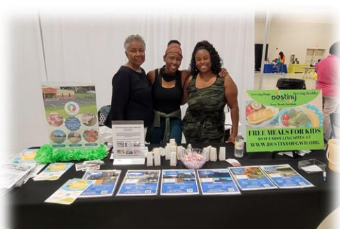
Destiny of Greenwood present as exhibitor.