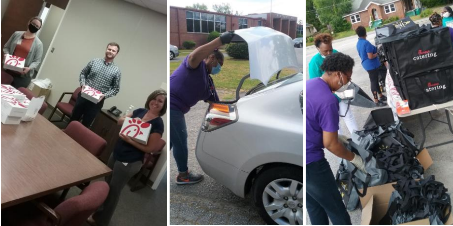
(Left Photo) City of Greenwood staff receiving lunch delivery from GLEAMNS staff during day of Community Action Day. (Middle Photo) GLEAMNS event staff placing food items in vehicle in drive-through line. (Right Photo) GLEAMNS staff placing items in resource bags.