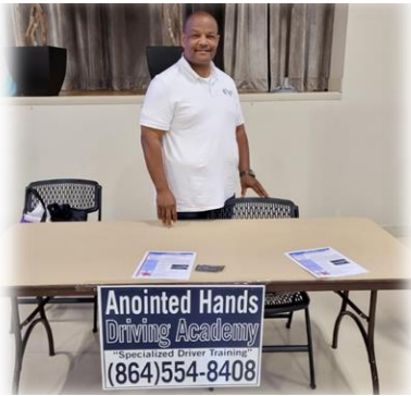
Anointed Hands Driving Academy present as exhibitor.