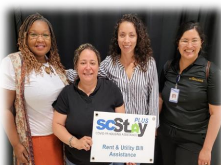
SC Stay Plus present as exhibitor. During the event, SC Stay Plus assisted customers with rent and utilities.