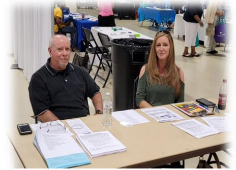
SC Thrive present as exhibitor.