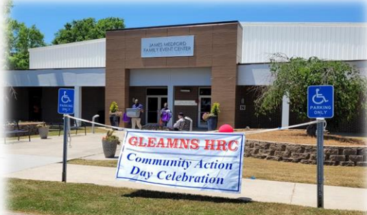
GLEAMNS banner welcoming attendees.