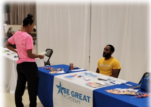
Attendee speaking with exhibitor.