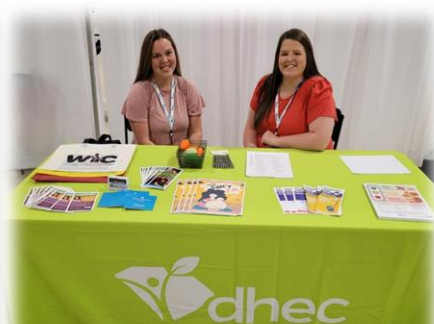
SC Department of Health & Environmental Control (DHEC) present as exhibitor.