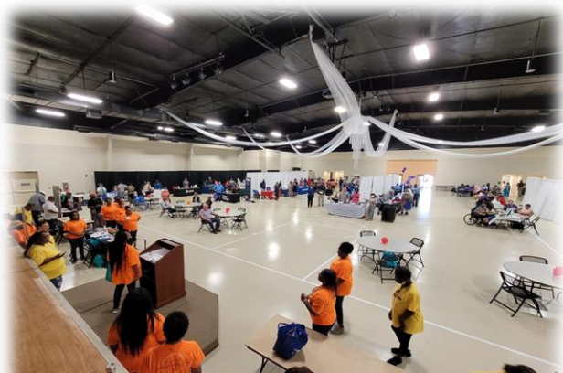
Venue before start of the event.

...And a special thank you to the vendors/partners who donated door prizes!